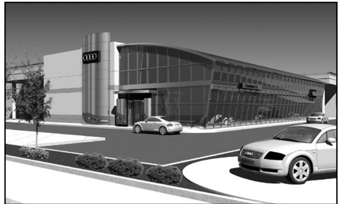
The new Audi dealership will be under the same roof as the Porsche and Volkswagen showrooms on Washington Blvd. and Figueroa St., adjacent to the 10 Fwy.

The new auto center also opens up land next to USC for students and the public. On the former site of the Volkswagen, Porsche and Audi stores, University Gateway Development, LLC (composed of Urban Partners and Shammass Investments, LLC) will construct a mixed-use