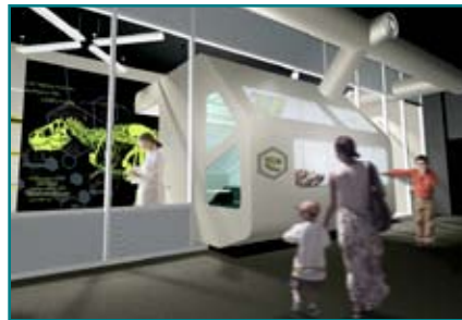
A rendering of the Natural History Museum of Los Angeles County's Thomas the T. rex Lab, as seen from the outside. Image courtesy of Hodgetts + Fung Design and Architecture.

There is a new dinosaur on the prowl at the Natural History Museum of Los Angeles County, located in the heart of the Figueroa Corridor. On March 30, 2008, the Natural History Museum opened its Thomas the T. rex Lab; a specially designed workroom where visitors are able to watch the actual work of paleontologists as they prepare and assemble the fossils of a 66 million year old Tyrannosaurus rex nicknamed "Thomas." He will become a permanent resident of the Museum's newly renovated Dinosaur Hall when it opens in 2010.