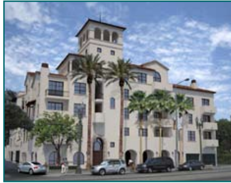
Rendering of new student housing.

More student housing is in the works for the Figueroa Corridor. Red Oak Investments, an Orange County-based real estate development firm, is planning to build 145-unit luxury student housing units at 2455 South Figueroa Street. The 1.7 acre site near the intersection of Figueroa Street and West Adams Blvd is currently the parking lot for the St. Vincent de Paul Catholic Church. Red Oak purchased the parking lot in 2007 and proposes to build a four story residential building over three levels of parking. Parking for St. Vincent's would be replaced at grade. The project would include recreation rooms, a fitness center, spa, management offices, study rooms, and up to 28,433 sq. ft. of open space.