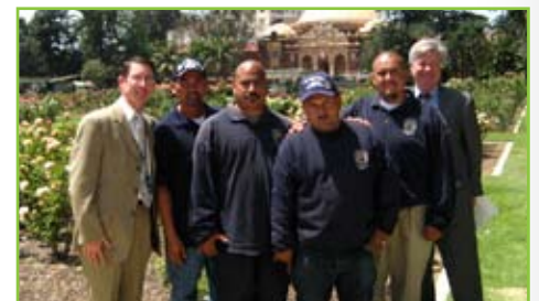
Rose Garden full time Gardeners