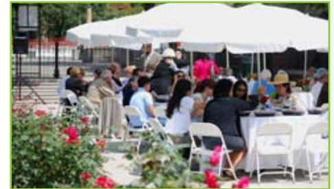
Attendees enjoying lunch in the Expo Park Rose Garden.