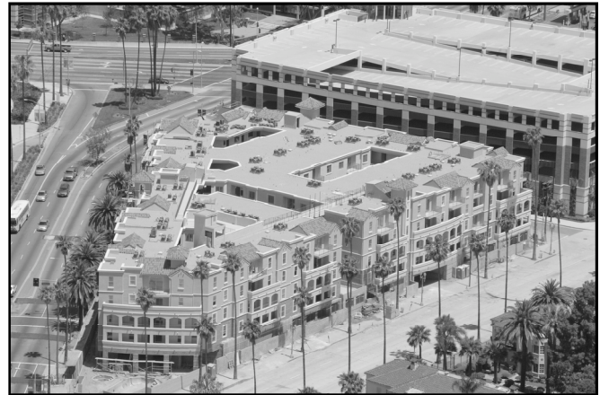
This aerial photo of the Tuscany shows its location on the east side of Figueroa Street just south of Exposition Boulevard. West-facing apartments have a view across Figueroa Street of the Amgen Center for Science Learning, located within a historic armory building, as well as the contemporary Science Center School.

In order to improve the streetscape surrounding the project, Conquest has completely redone all of the sidewalks and curbs and added new landscaping along the Figueroa Street frontage.