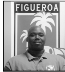
Sentel White Ambassador Team