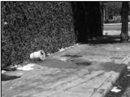
Hoover Street Before Clean-up

It is a new year in the Figueroa Corridor and this new year brings welcomed change. In the 11th year of its successful business improvement district (BID), members have renewed the