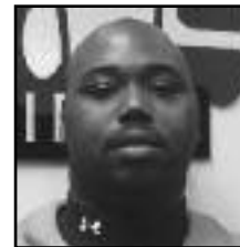
Sentel White Ambassador Team