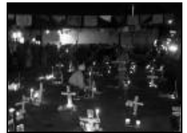
Dia Los Muertos Community Festival

designed to get elementary students out of their seats and onto the stage! Activities such as improvisation, character development and storytelling techniques, begin in the classroom and move to the stage for an exciting field trip to the theatre. In addition to “Enter Stage Right”, the Theatre hosts a number of other programs for youth, including the “After ‘Cool’ Theatre Program for local neighborhood schools, the Saturday Explorer Series for the family, and other community events such as the annual Halloween Block Party and Dia Da Los Muertos events, serving local families.