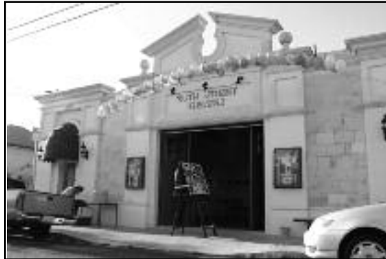
Exterior Shot of 24th Street Theatre

There is a hidden gem located just outside the expansion area of the Figueroa Corridor District. Located at the corner of Hoover and 24th Streets at 1117 West 24th Street is the 24th Street Theatre, a rich cultural and artistic resource for the community and greater Los Angeles (LA) area, providing access to high quality theatre for children and families.