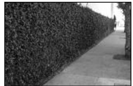
Hoover Street After Clean-up