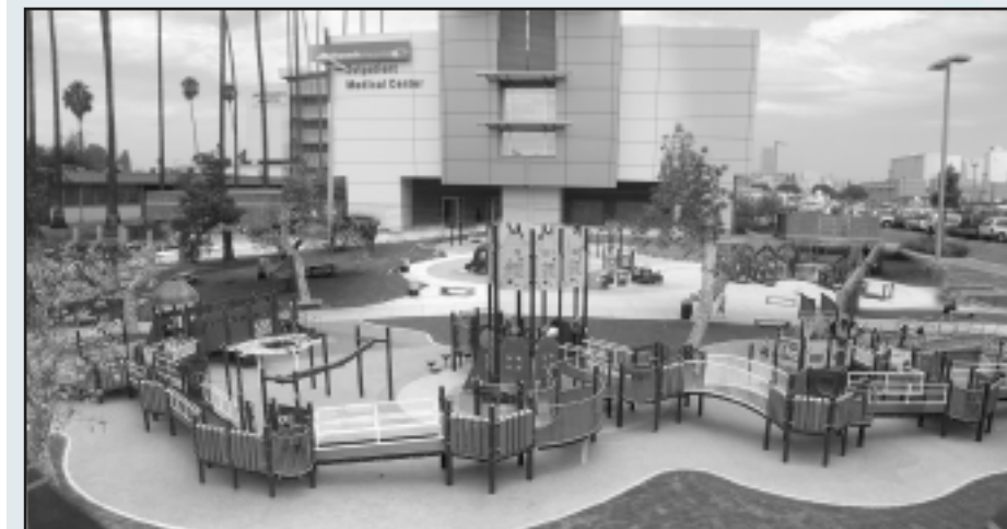
The above rendering is a mock-up of what the Orthopaedic Hospital's Universally Accessible Playground for children might look like. The actual playground will be designed with input from parents, children, and health professionals from the local community.